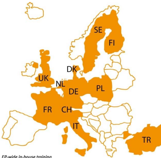
EP-wide in-house training