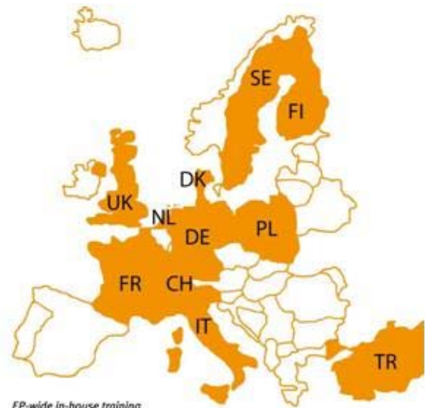
EP-wide in-house training

Those who desire to establish basic knowledge in intellectual property (such as trainee patent attorneys, IP coordinators, but also inventors) we recommend following our 3-day Patent Tutorial – Introduction to Patents . A detailed brochure can be downloaded from www.deltapatents.com .