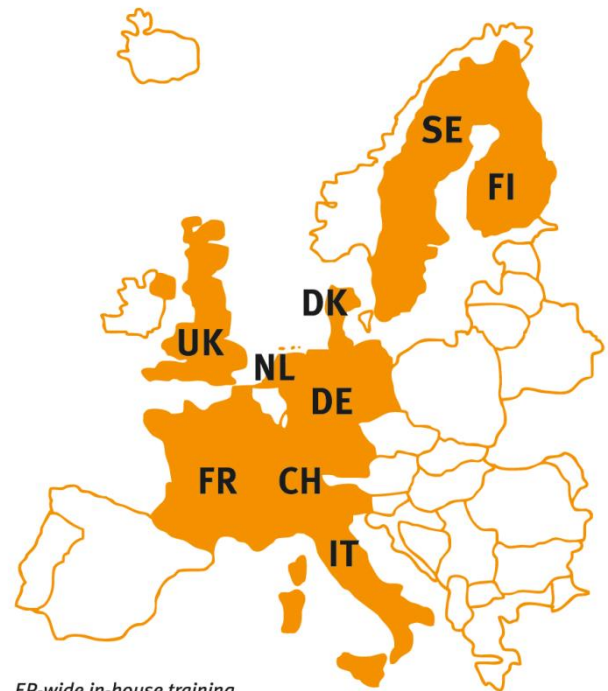
EP-wide in-house training

Please check our website ( www.deltapatents.com ) for our cancellation policy.